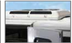
Rooftop Mounted AC