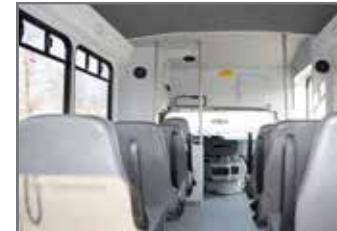
Stylish Coving with Integrated Dome Lights