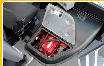
Engine access provides wider aisle for passenger loading and quieter ride for drivers.