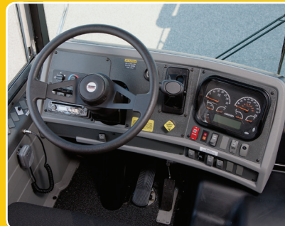
Cockpit design allows for better driver comfort.

* Some options only available through dealerships