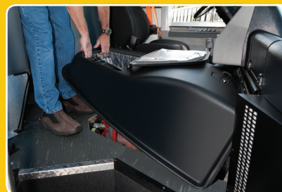
Easy engine access with no tools required.