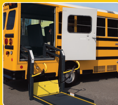
Wheelchair lift is optional for special needs applications.