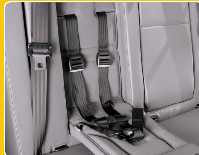
Integrated child seat with seatbelt is one of many seating options.