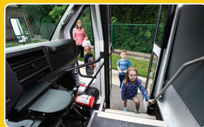
The Saf-T-Vue window offers 306 square inches of glass for optimal exterior visibility.